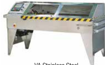
VA Stainless Steel

*Contact our Sales team to find out which accessories come with your machine.