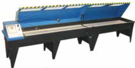
Test bed extension