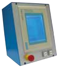
Control B Touch