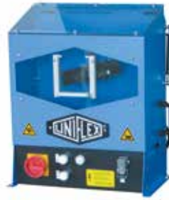
USM 10 Ecoline USM 10