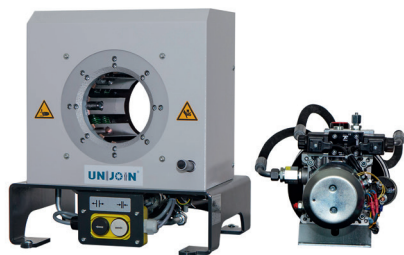
UG 32 Mobileline