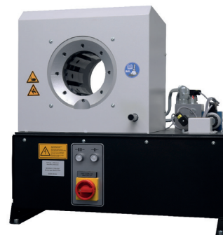
UG 32 S