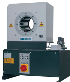
UG 32 Ecoline