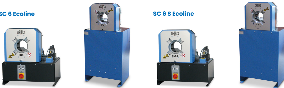
SC 6 S Ecoline