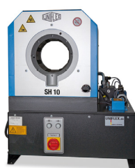
SH 10 XL Ecoline